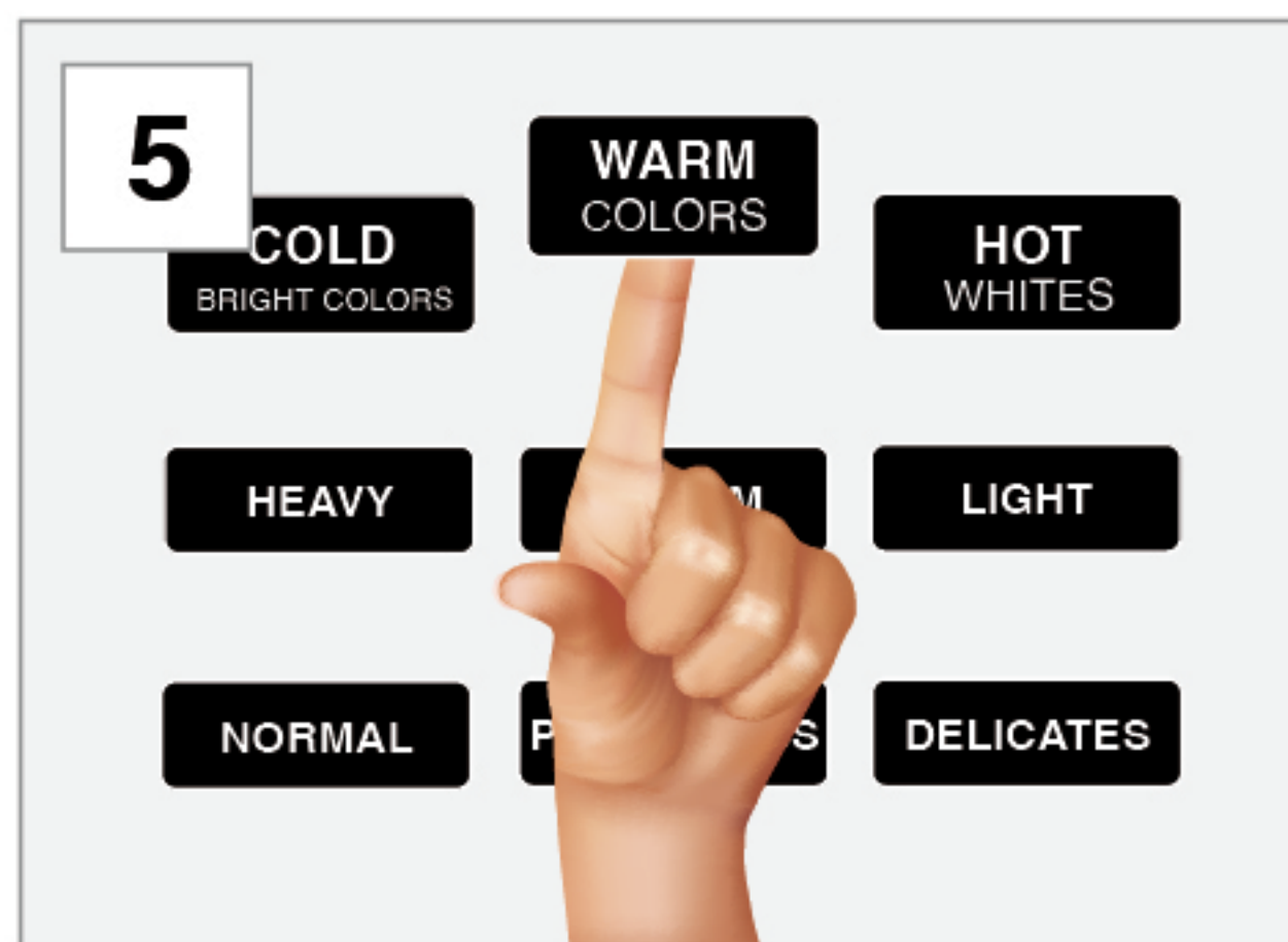
5 After loading your laundry, select your temperature / soil / fabric settings