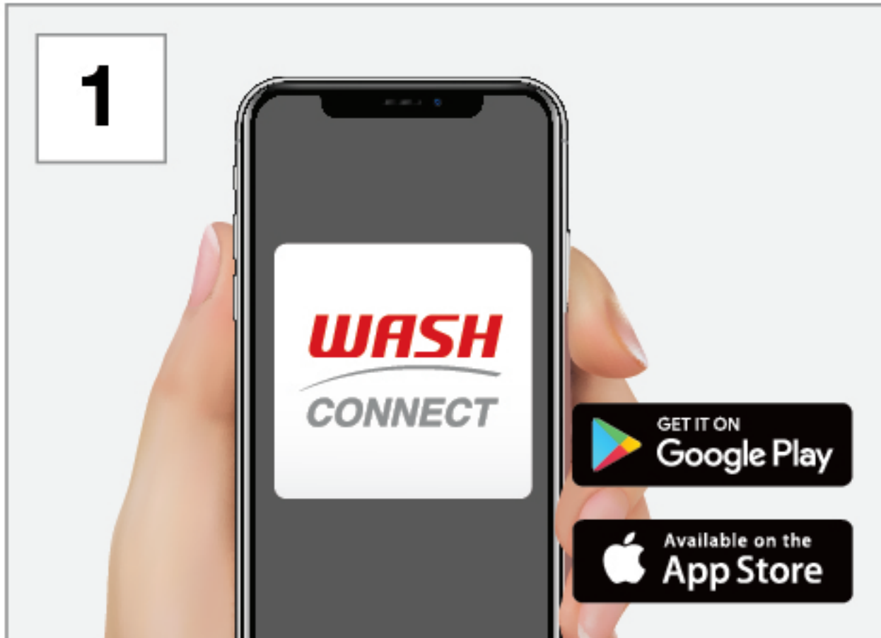
1 Download the WASH-Connect App