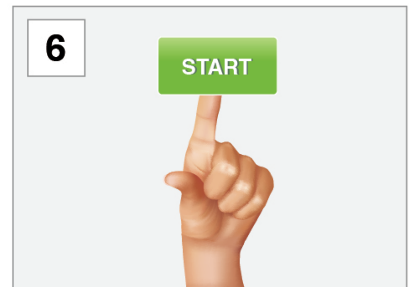
6 Press START on the machine and confirm payment on the app