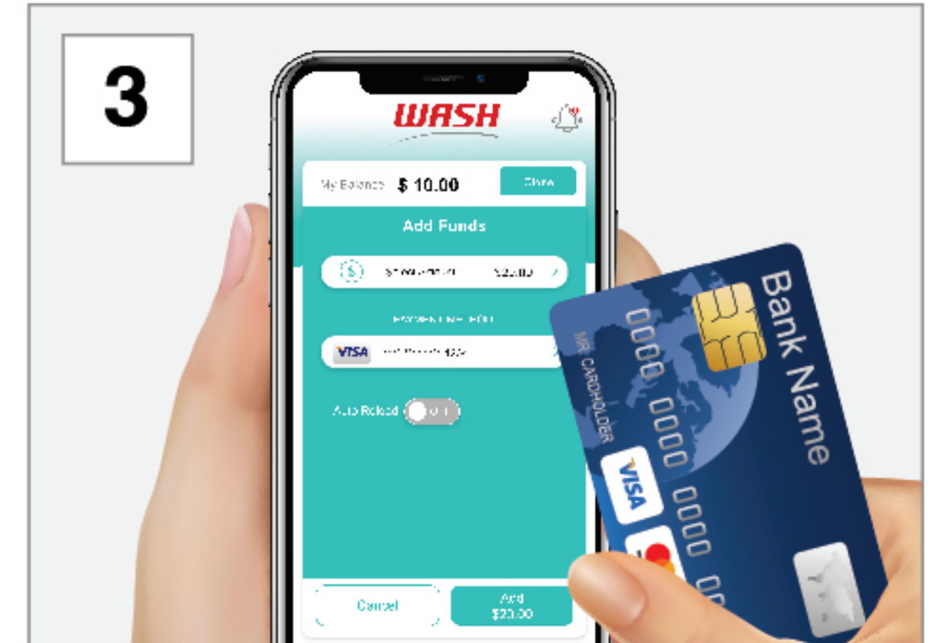
3 Add Funds with Credit or Debit Card