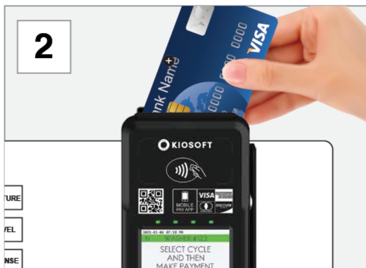
2 Insert, tap, or swipe your credit or debit card