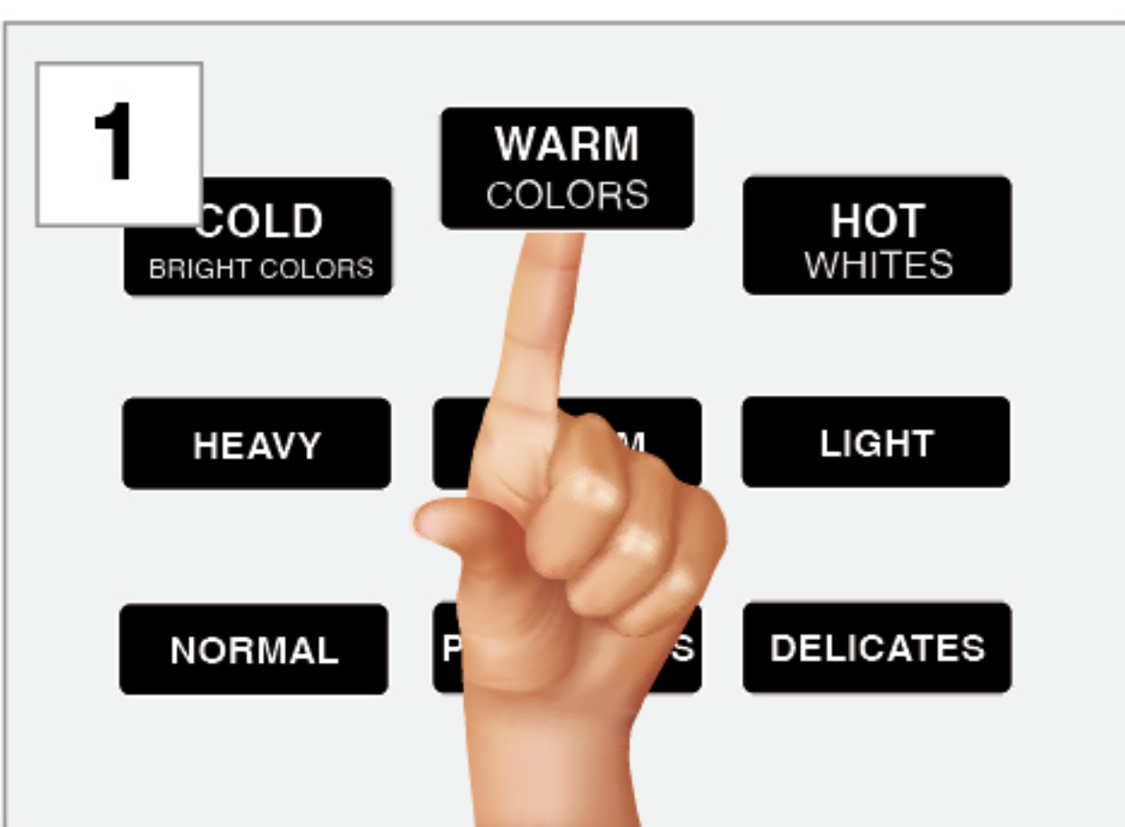
1 After loading your laundry, select your temperature / soil / fabric settings