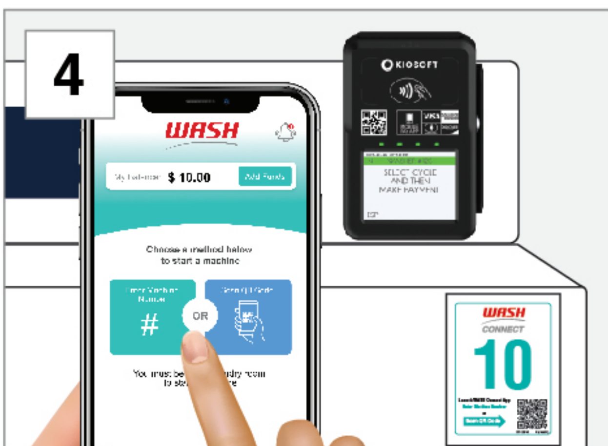
4 Enter machine number or scan QR code to connect to a machine